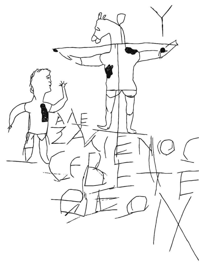
Tracing of the graffito carved in the plaster

The image depicts a human-like figure who is attached to a cross and who has the head of a donkey. To the left of the image is a young man, apparently intended to represent Alexamenos, who is raising one hand in a gesture possibly suggesting worship. Beneath the cross there is a caption written in Greek: A\lambda \varepsilon \xi \alpha \mu \varepsilon v \circ \zeta \ c \varepsilon \delta \varepsilon \tau \varepsilon \ \vartheta \varepsilon o v , which means "Alexamenos worships (or: worshipping) God". ^5