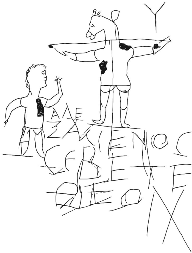
Tracing of the graffito carved in the plaster