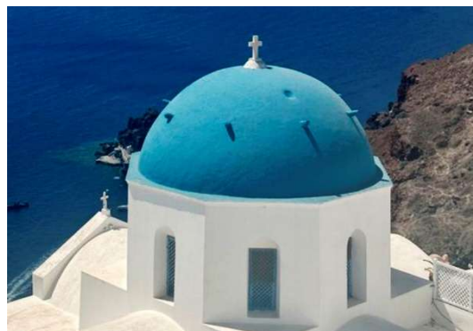
Greek church in Oia.

If we did not know the meaning that the Greeks give to this word, we would need to do no more than to look at any Greek church, and we would see on the top of the building, outside, a cross , not a stake!